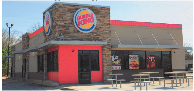
The new facade of Burger King.