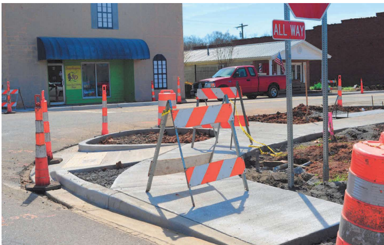
East Front Street getting a makeover.